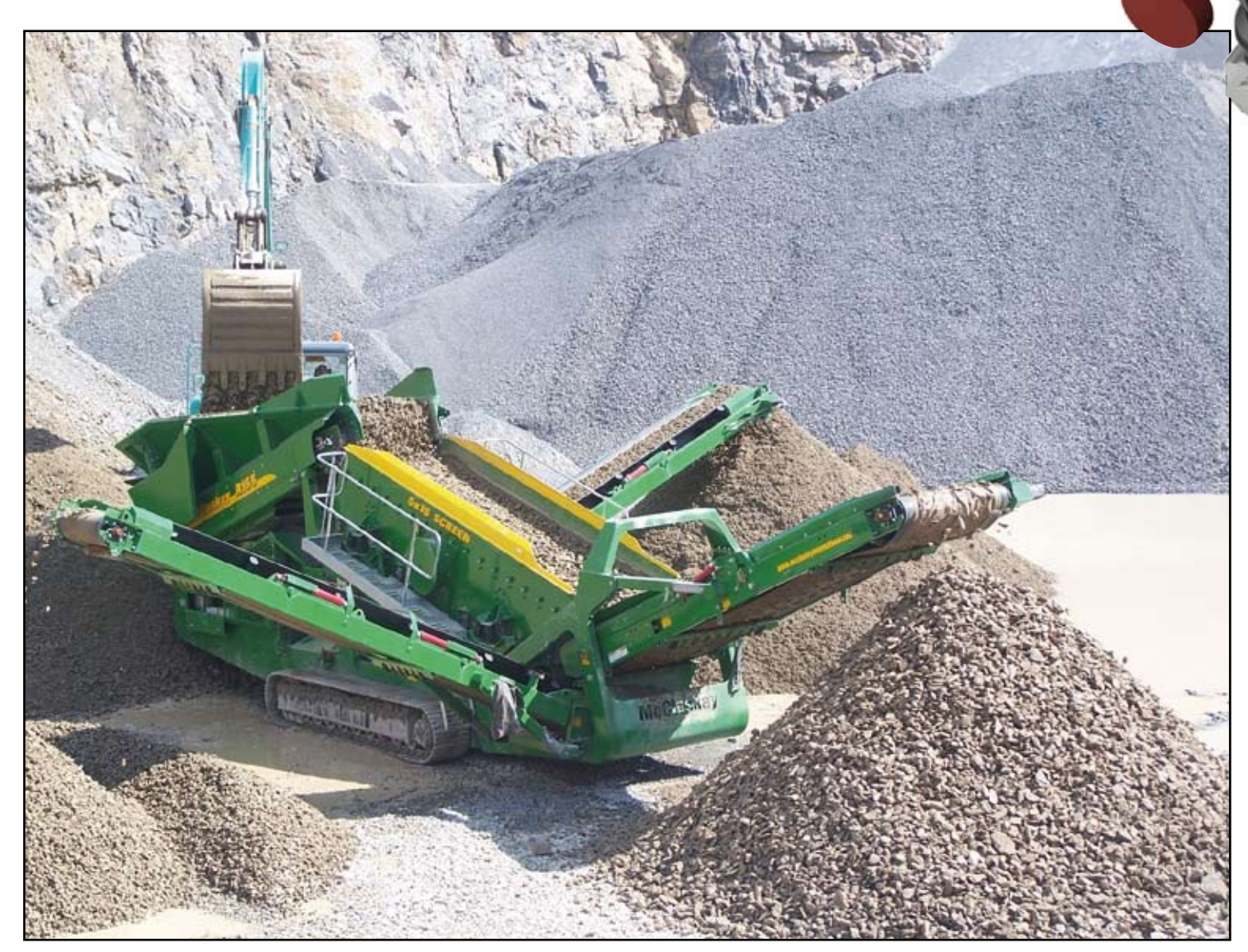
McCloskey's R155 high-energy vibrating screener incorporates the Nimco CV691 and CV791 control valves for optimum performance

One of the key issues when designing a screening machine is to give the end user the ability to accurately set the speed of all the different conveyor belts. This is of great importance because the